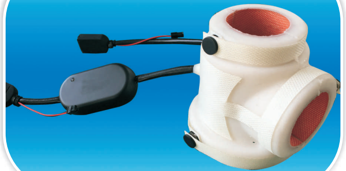
Poppet valve heater