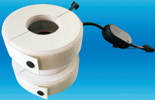
Check valve heater